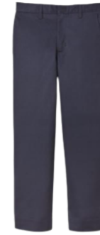
*Navy Twill Pants