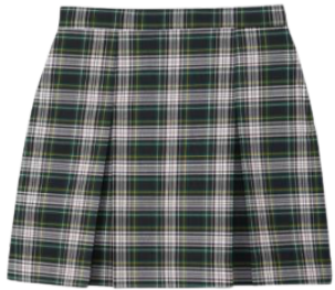
*Plaid Elastic Waist Skirt