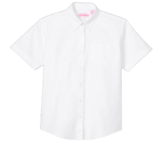
*White Short Sleeve Oxford w/ school logo