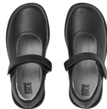
Black Mary Janes