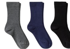
Navy, Black, or Grey Solid color socks, must rise above the shoe