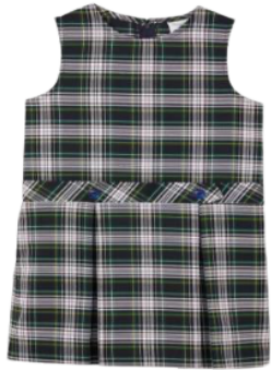
*Plaid Drop Waist Jumper