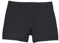
modesty shorts - solid black or navy (required) must not be longer than skirt