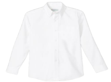
*White Long Sleeve Oxford w/ school logo