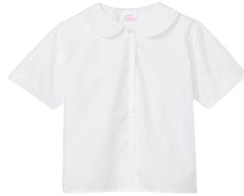
*White Peter Pan Blouse