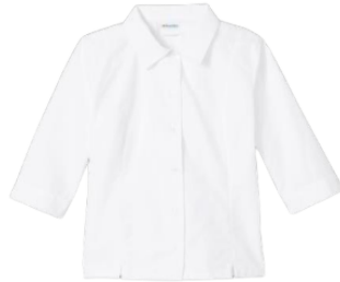
*3/4 Sleeve Fitted Blouse w/school logo